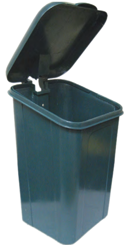
Poly Waste Receptacle Forest Green #1208-L

Either Steel Trash Receptacle with lid can be purchased in Aluminum (#1206A-L / #1206A-BLK-L)