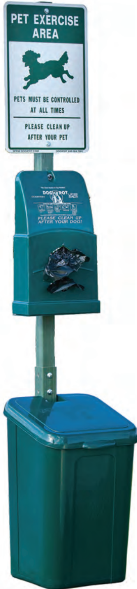
POLY PET STATION - POLY POST Forest Green #1010