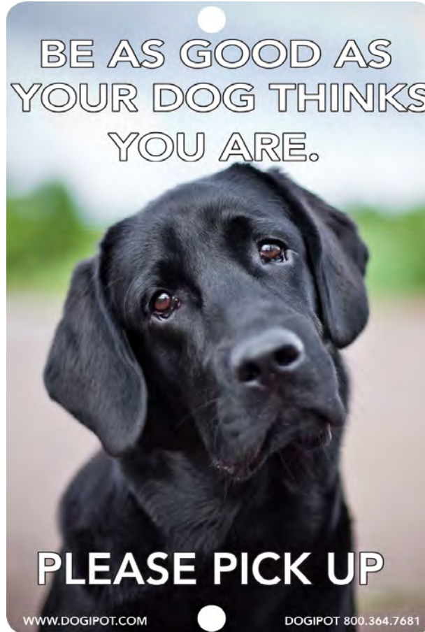
ON-LEASH "Be Good" Pet Sign #1204-BLR