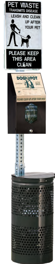
Aluminum/Steel Header Pak Pet Station Black #1003HP-BLK-L

Either Pet Station may be purchased in all Aluminum (#1003HPA-L / #1003HPA-BLK-L)