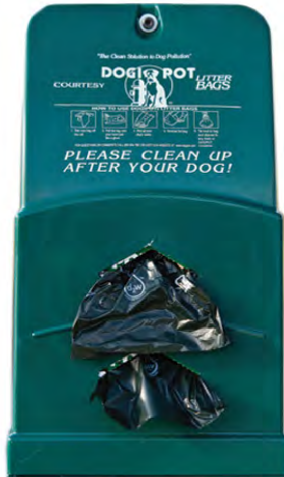
Poly Junior Bag Dispenser Forest Green #1007-2