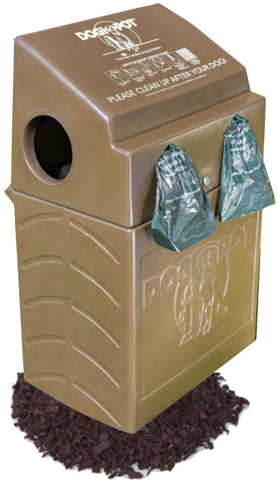
Poly DOGVALET® Mulch #1005MCH-2