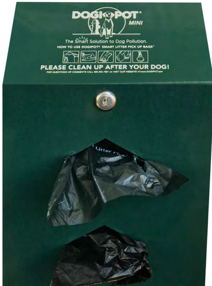
Aluminum MINI Bag Dispenser Forest Green #1002M-2