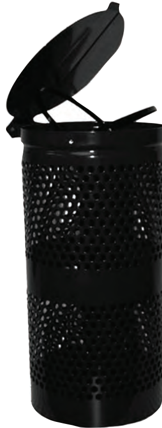
Steel Waste Receptacle Black #1206BLK-L