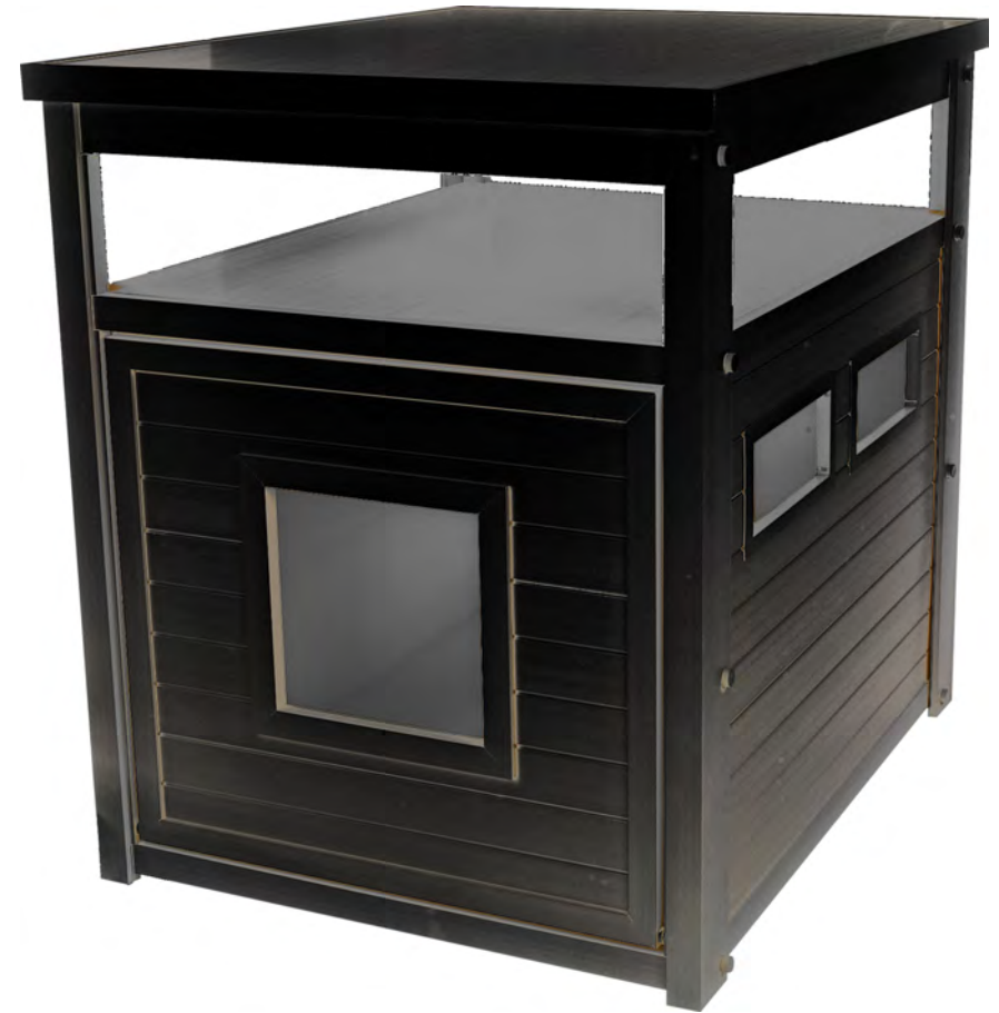
CAT LITTER BOX END TABLE ESPRESSO