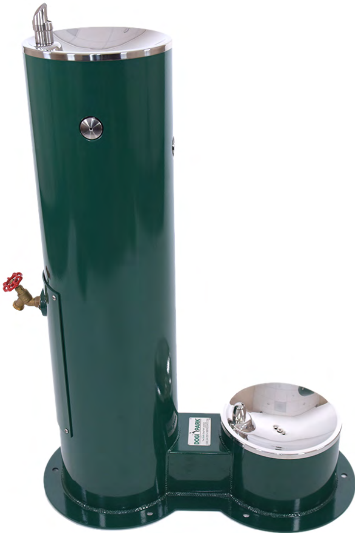
DOGIPARK® DOGI-Fountain Double Bowl Tower with Hose Bib Forest Green #7752-GREEN