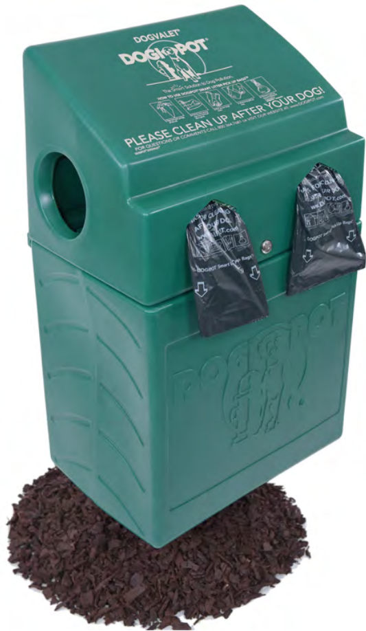
Poly DOGVALET® Forest Green #1005-2