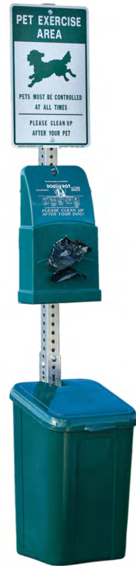
POLY PET STATION - STEEL POST Forest Green #1010-S