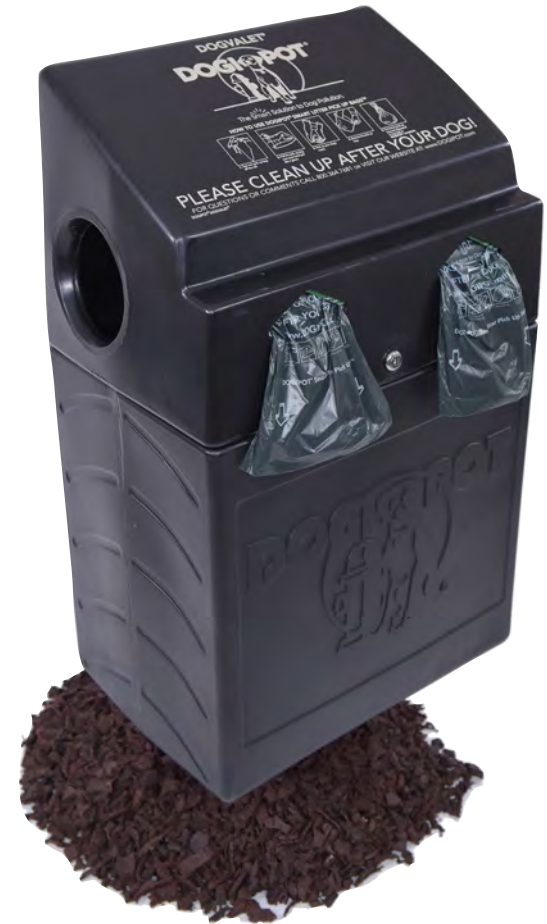
Poly DOGVALET® Black #1005BLK-2