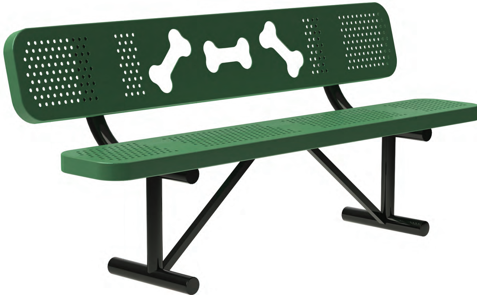
DOGIPARK® Steel Dog-Themed Bench Forest Green #7711