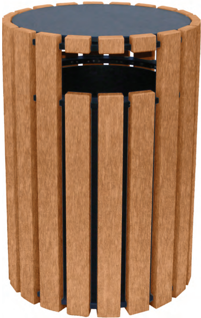
Poly Trash Receptacle Black/Cedar #7722-BC