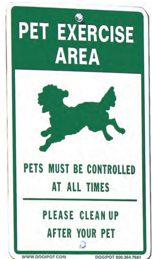
OFF-LEASH Pet Sign Green #1204