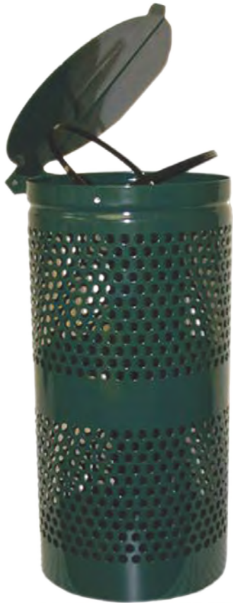
Steel Waste Receptacle Forest Green #1206-L