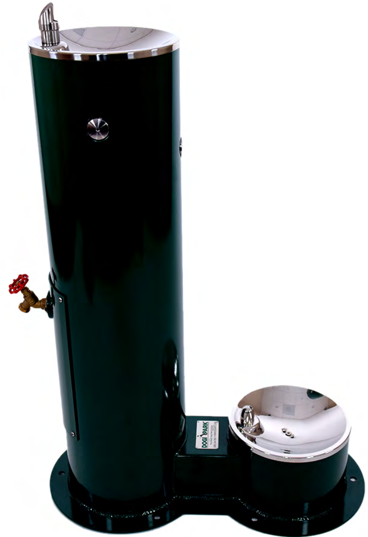
DOGIPARK® DOGI-Fountain Double Bowl Tower with Hose Bib Black #7752-BLACK