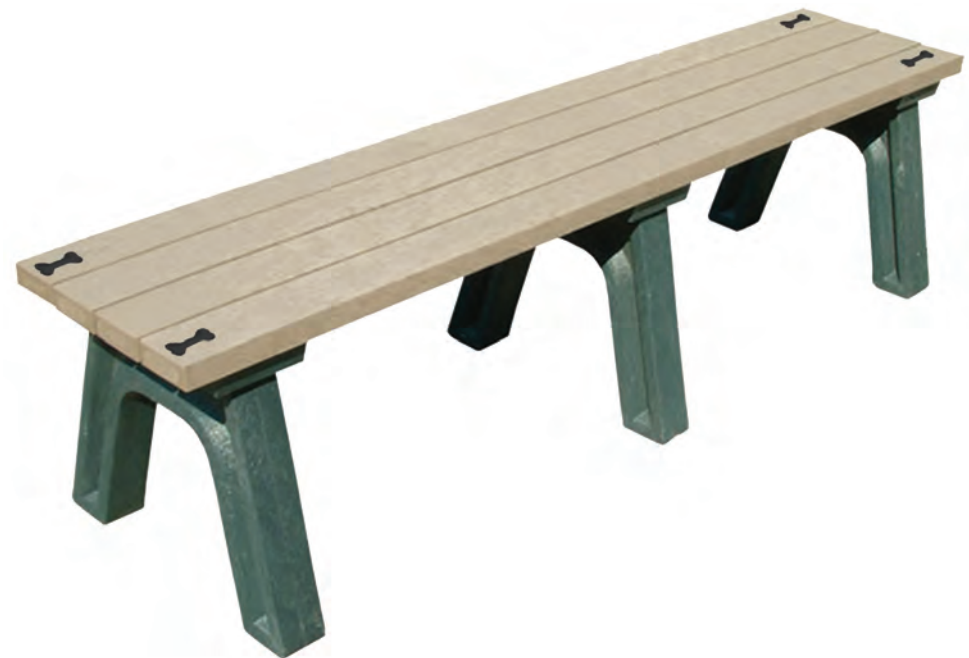
DOGIPARK® Flat Poly Bench with Bones Green/Sand #7712-GS-BONES