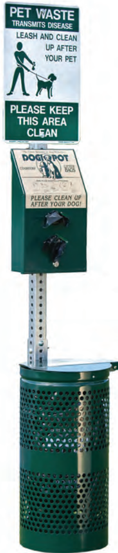
Aluminum/Steel Pet Station Forest Green #1003-L