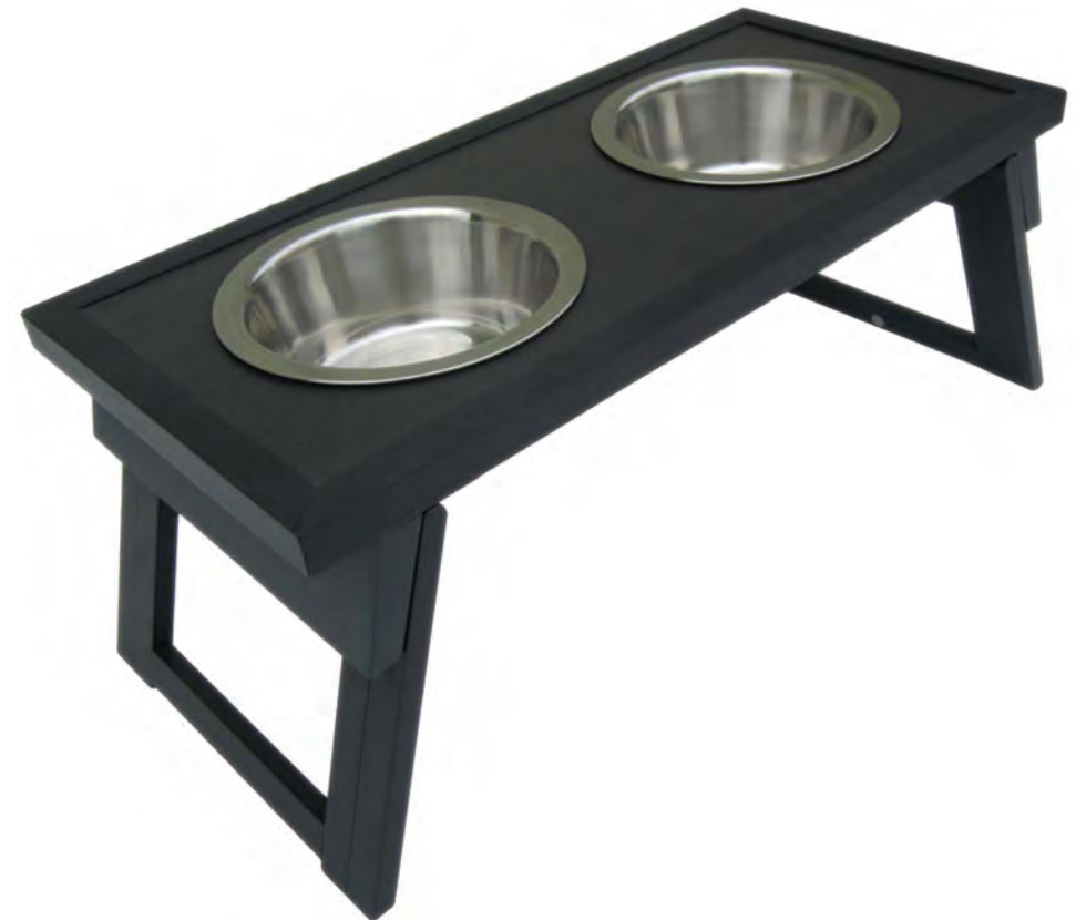
DOGIPET® Adjustable Diner Small (16.5"L x 8.1"W x 5.5"H (open) #1704-S