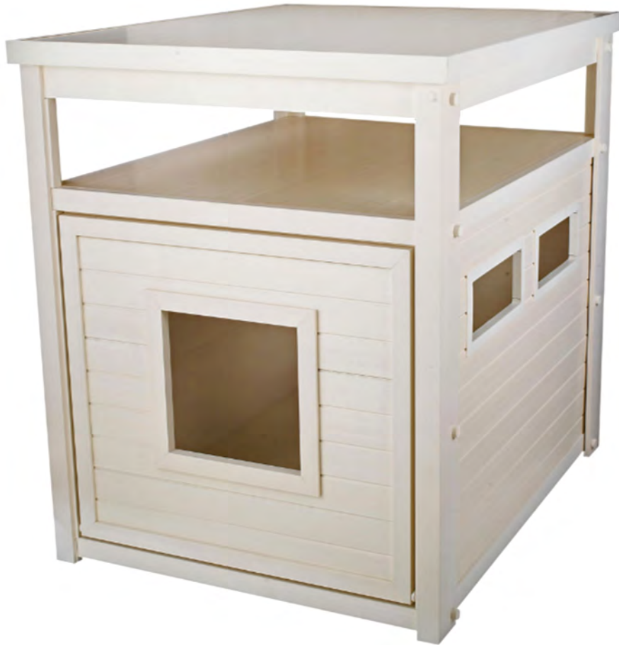
CAT LITTER BOX END TABLE ANTIQUÉ WHITE