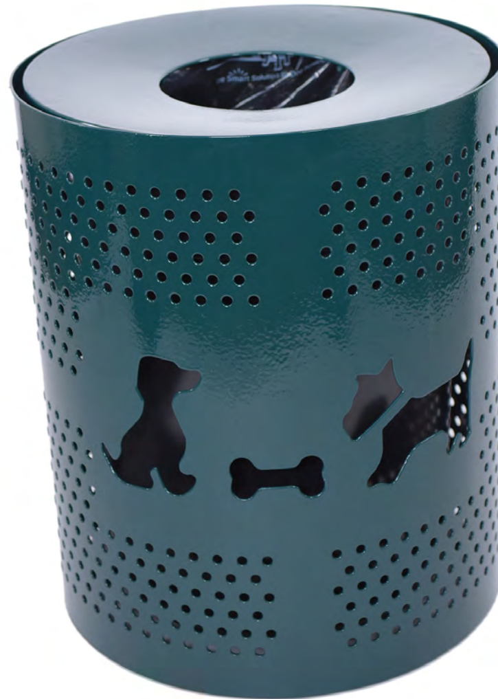
DOGIPARK® Steel Dog-Themed Trash Receptacle Forest Green #7721