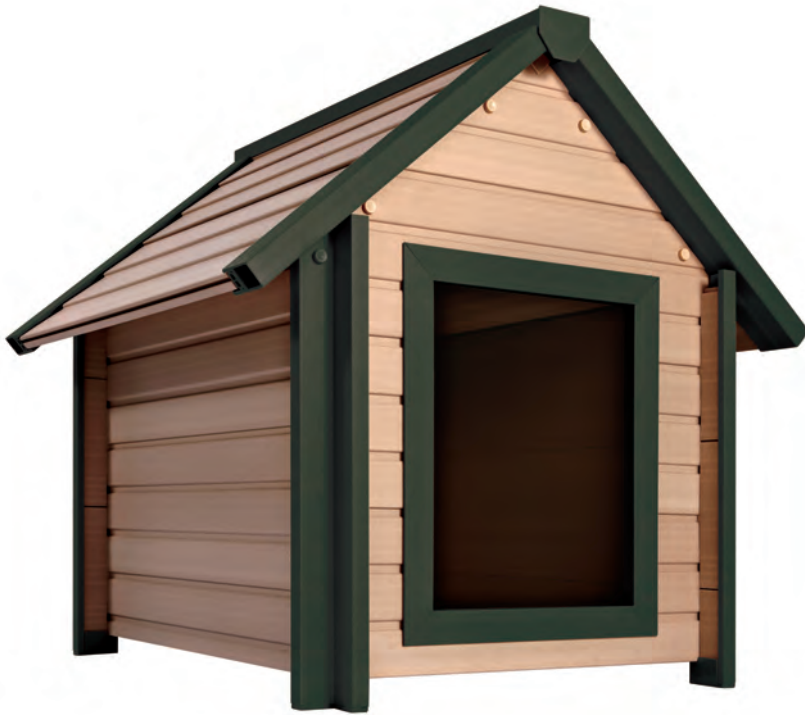
DOGIPET® BUNK HOUSE NATURAL/GREEN