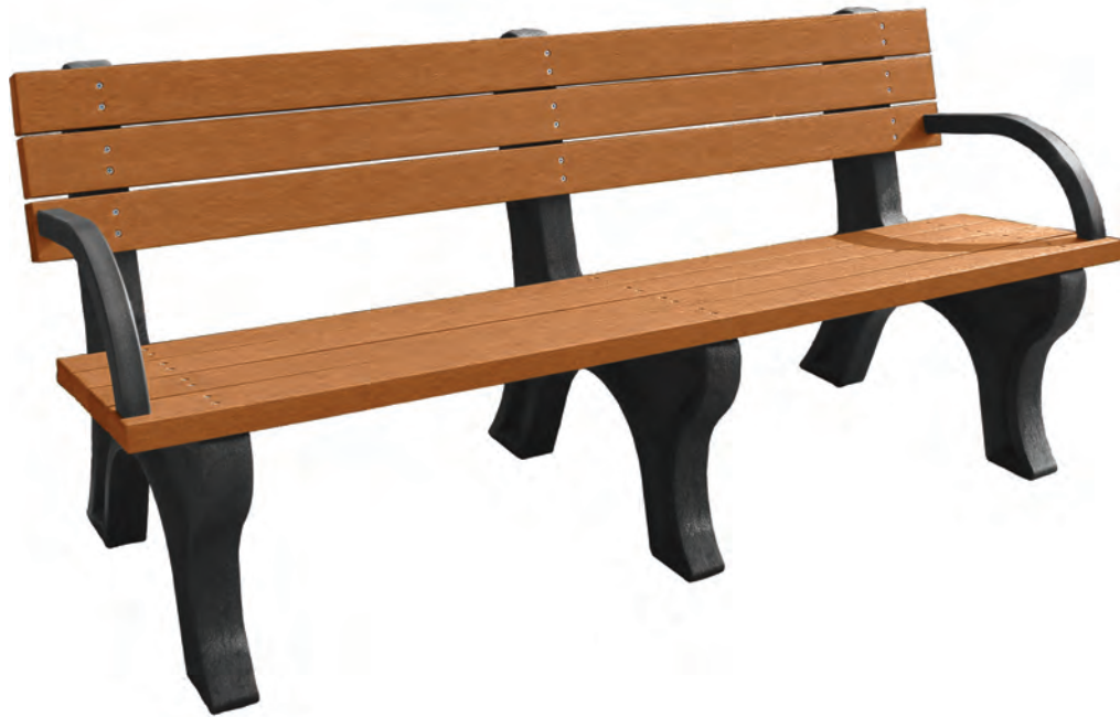
Backed Poly Bench Black/Cedar #7713-BC