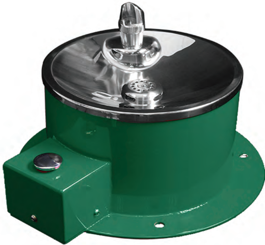
DOGIPARK® DOGI-Fountain Pedestal Forest Green #7751-GREEN