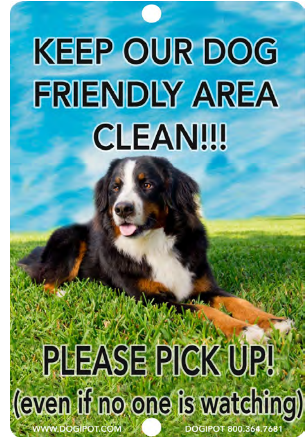
ON-LEASH "Keep Clean" Pet Sign #1204-BMD