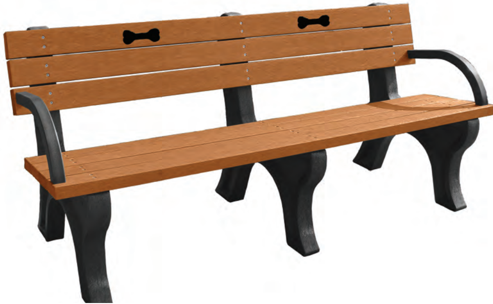
DOGIPARK® Backed Poly Bench with Bones Black/Cedar #7713-BC-BONES