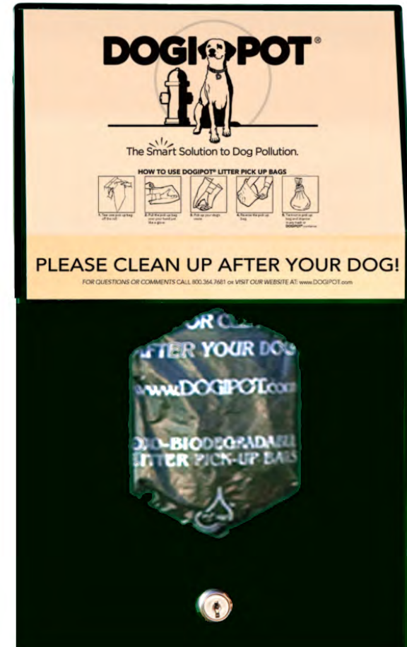
Aluminum Header Pak Junior Bag Dispenser Black #1002HP-BLK-4