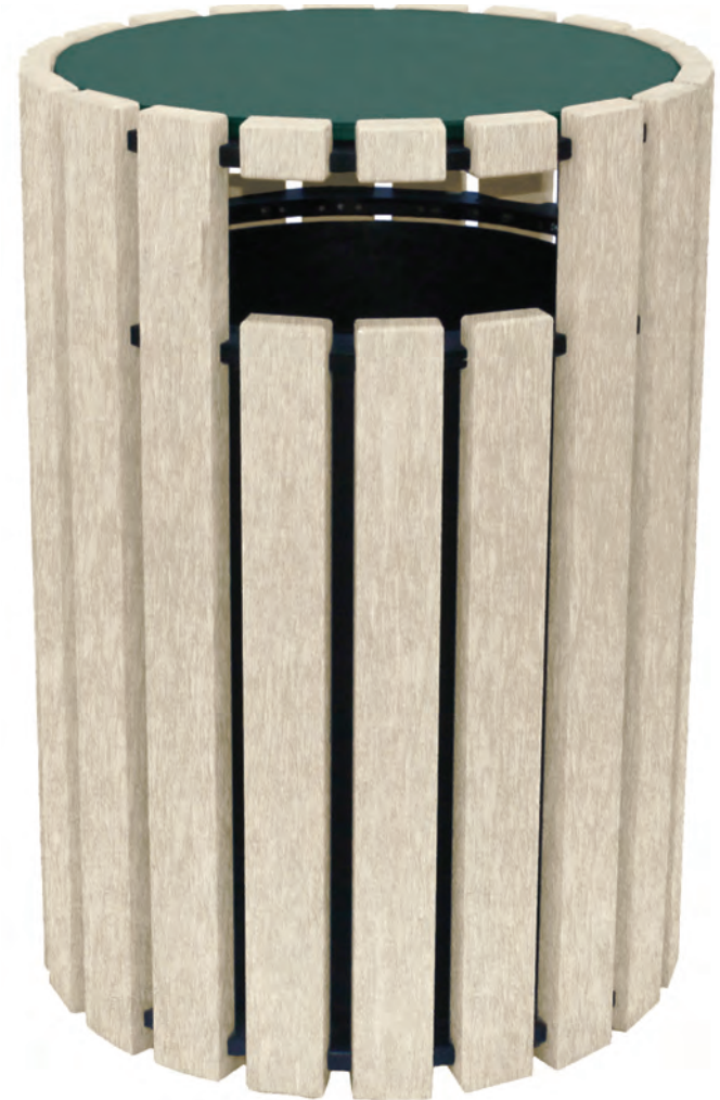
Poly Trash Receptacle Green/Sand #7722-GS