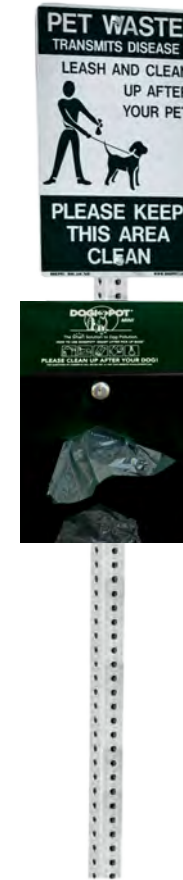
ALUMINUM QUIK PET STATION Black #1011-MINI-BLK