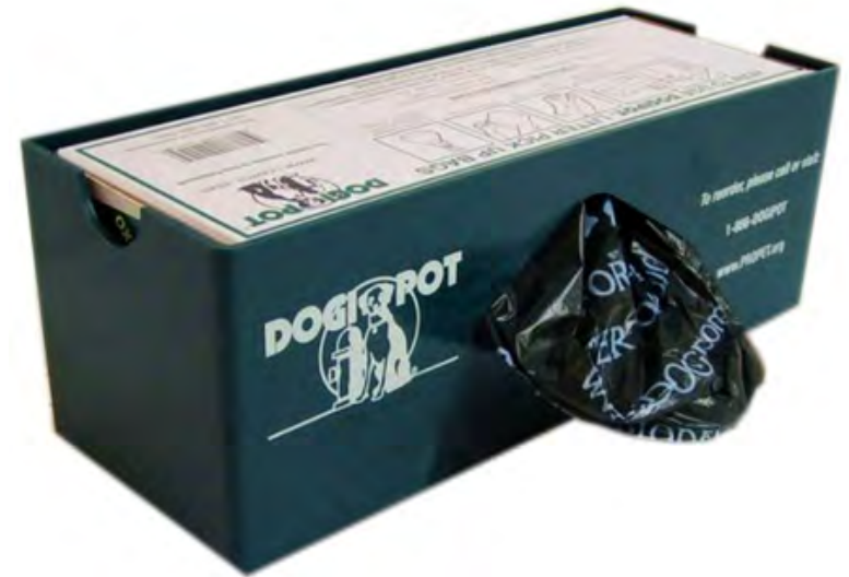
Poly Single Roll Dispenser Forest Green #1008-1