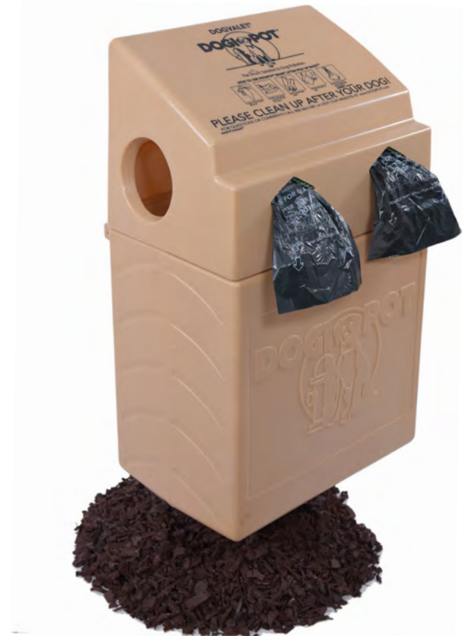
Poly DOGVALET® Sand Beige #1006-2