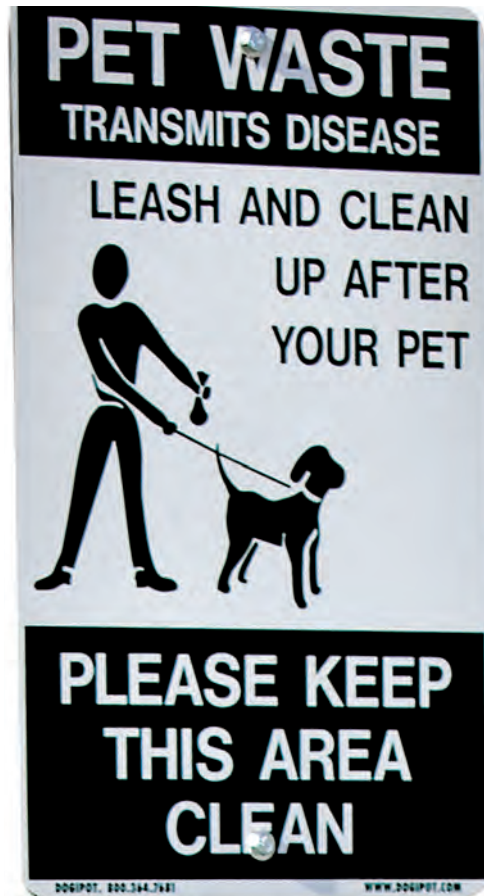
ON-LEASH Pet Sign Black #1203-BLK