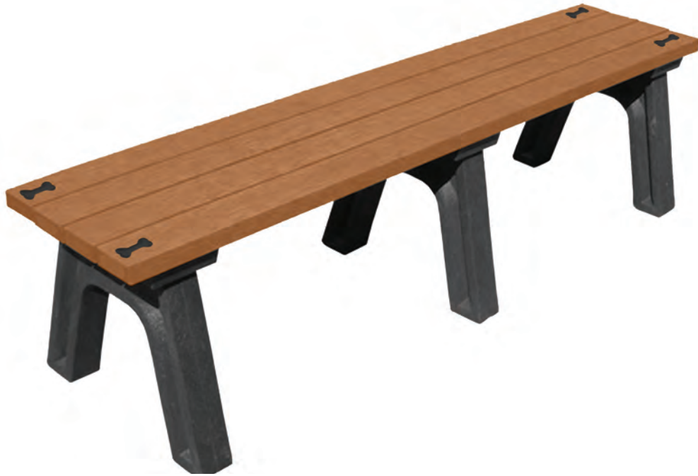
DOGIPARK® Flat Poly Bench with Bones Black/Cedar #7712-BC-BONES