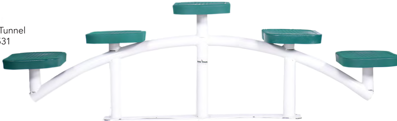
DOGI-Stepping Bones #7521