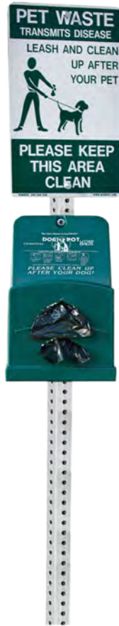
POLY QUIK PET STATION Forest Green #1011-POLY