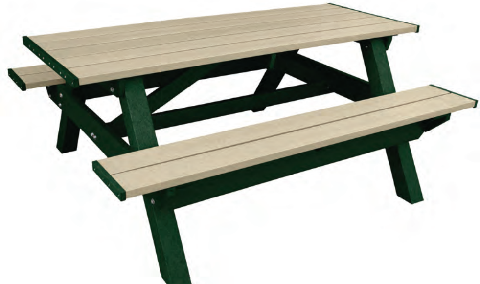
Poly Picnic Table Green/Sand #7791-GS