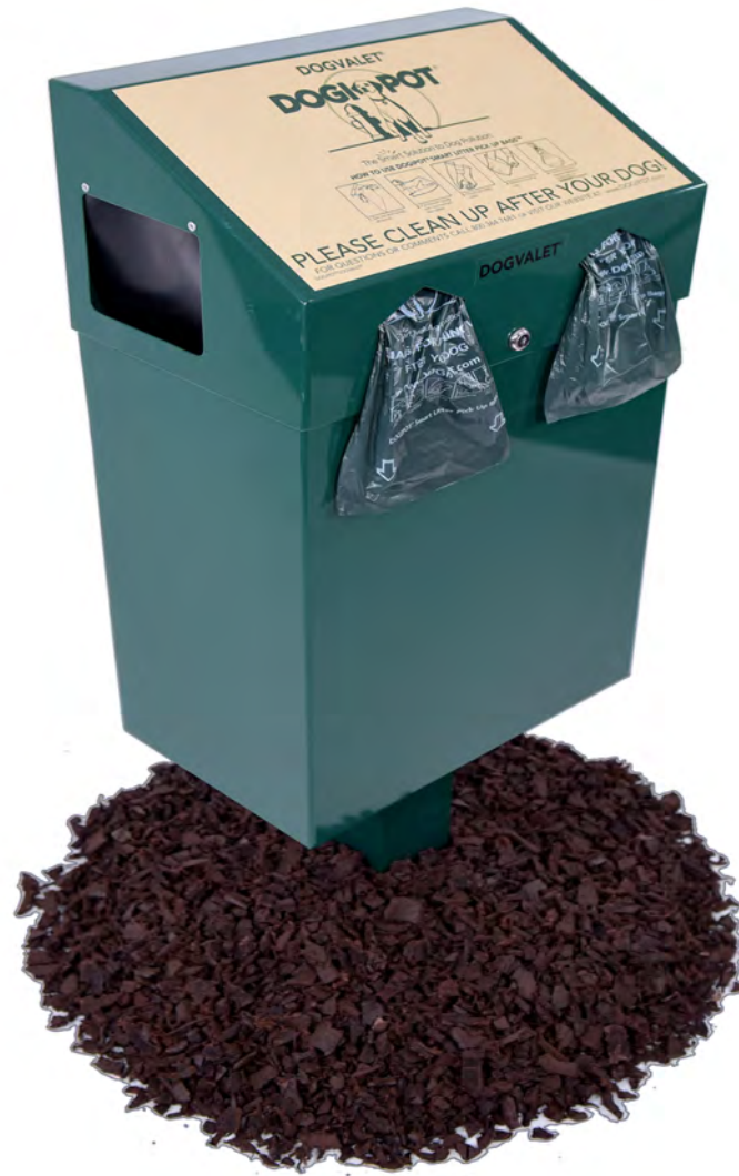
Aluminum DOGVALET® Forest Green #1001-2