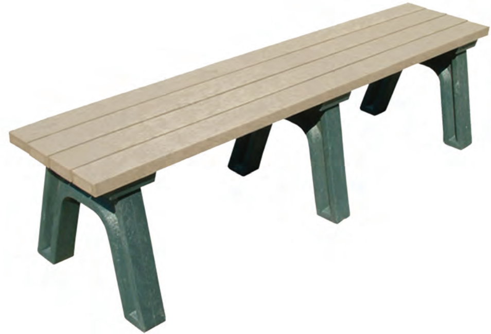
Flat Poly Bench Green/Sand #7712-GS