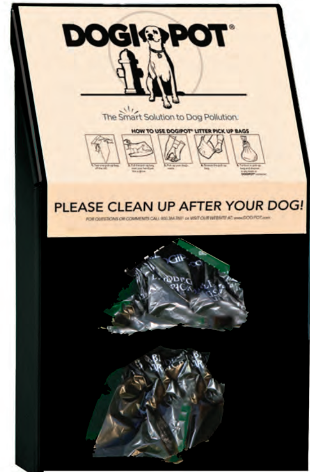
Aluminum Junior Bag Dispenser Black #1002-BLK-2