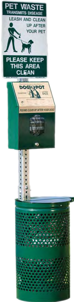
Aluminum/Steel Header Pak Pet Station Forest Green #1003HP-L