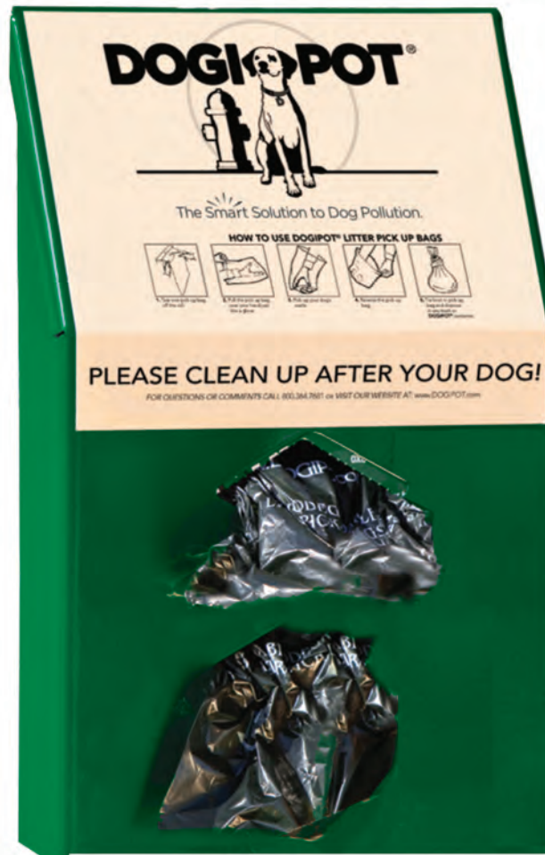
Aluminum Junior Bag Dispenser Forest Green #1002-2