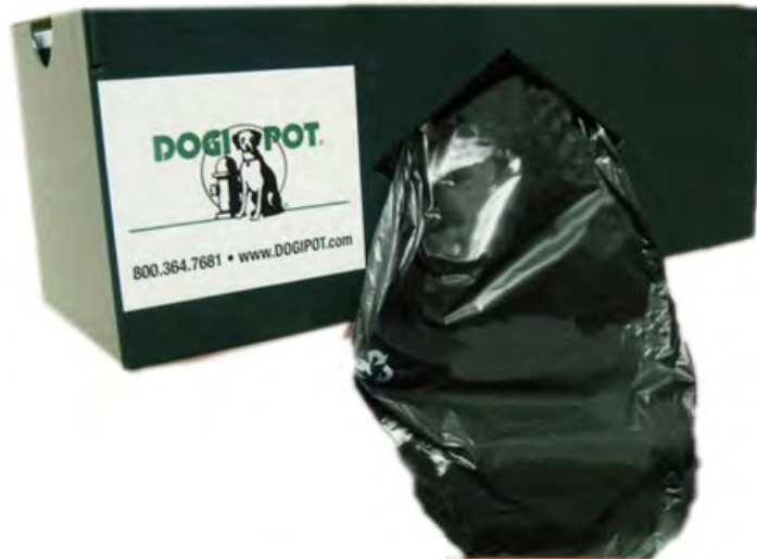
Aluminum Single Roll Dispenser Forest Green #1004-1