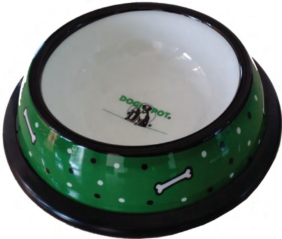
DOGIPET® Dog Bowl 10" W x 2.5" D #1701-L