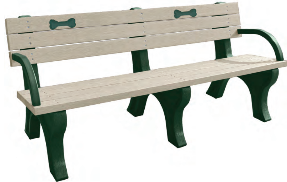
DOGIPARK® Backed Poly Bench with Bones Green/Sand #7713-GS-BONES