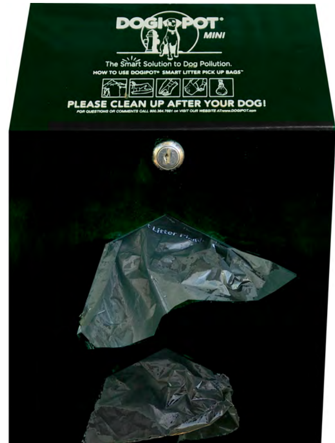
Aluminum MINI Bag Dispenser Black #1002M-BLK-2