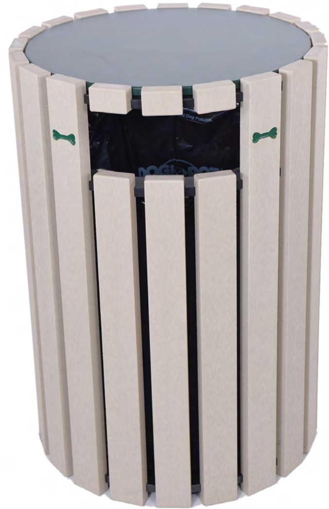
DOGIPARK® Poly Trash Receptacle w/Bones Green/Sand #7722-GS-BONES