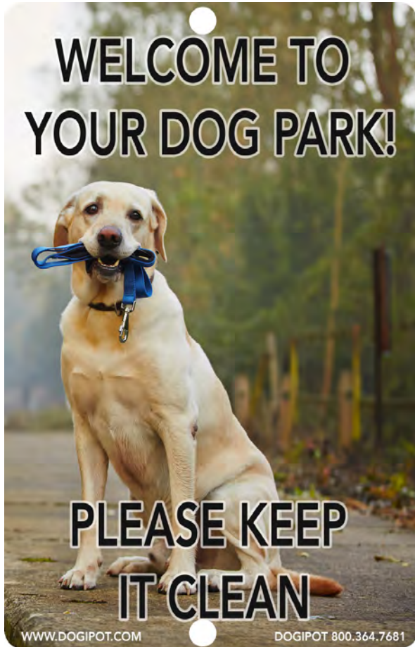
ON-LEASH "Welcome" Pet Sign #1204-YLR