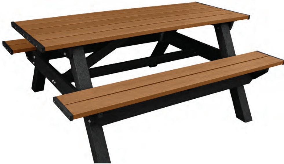
Poly Picnic Table Black/Cedar #7791-BC