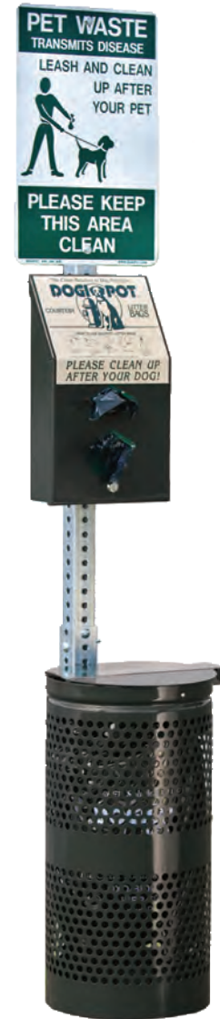
Aluminum/Steel Pet Station Black #1003BLK-L

Either Pet Station may be purchased in all Aluminum (#1003A-L / #1003A-BLK-L)