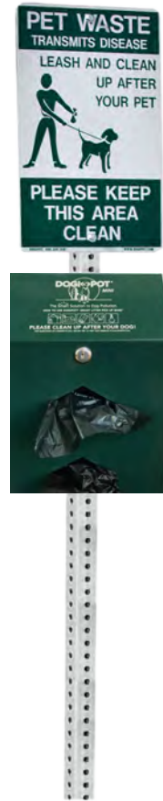
ALUMINUM QUIK PET STATION Forest Green #1011-MINI