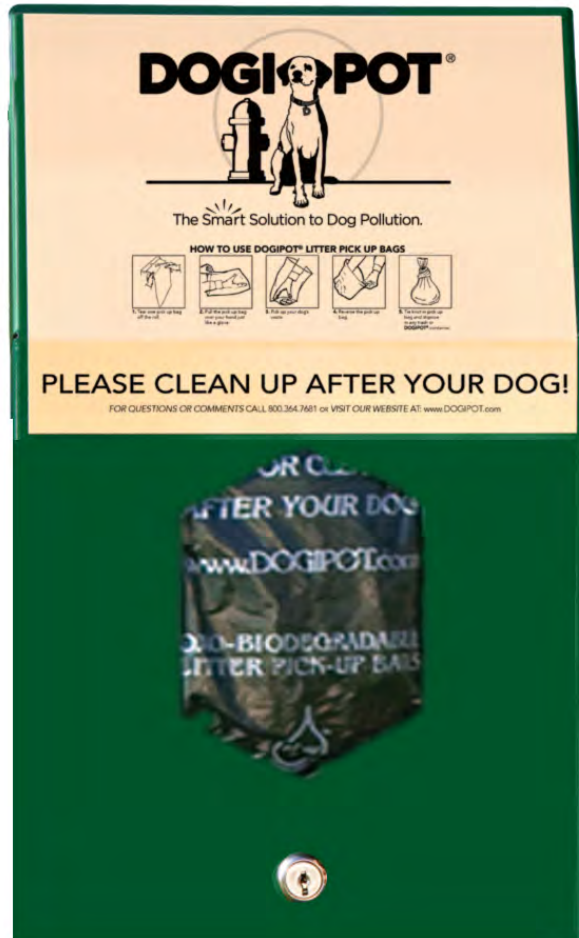
Aluminum Header Pak Junior Bag Dispenser Forest Green #1002HP-4