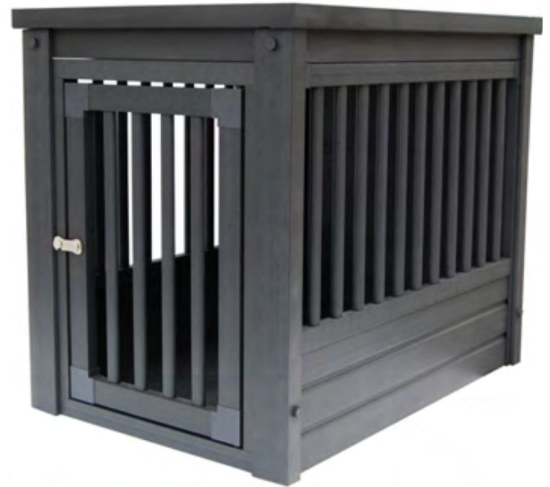
DOGIPET® CRATE ESPRESSO