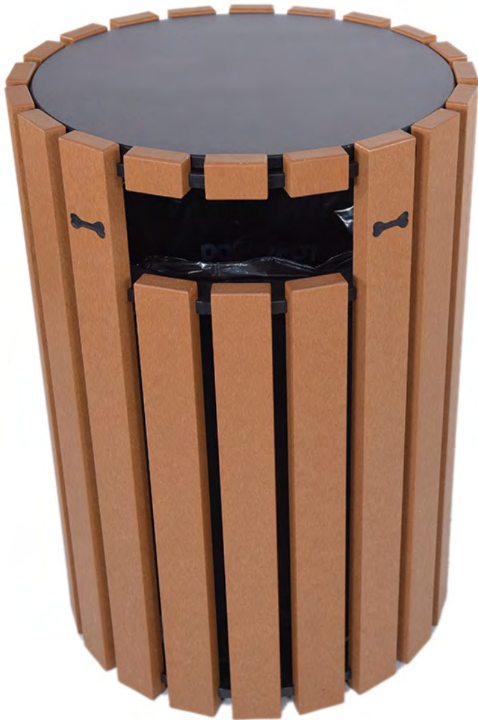
DOGIPARK® Poly Trash Receptacle w/Bones Black/Cedar #7722-BC-BONES