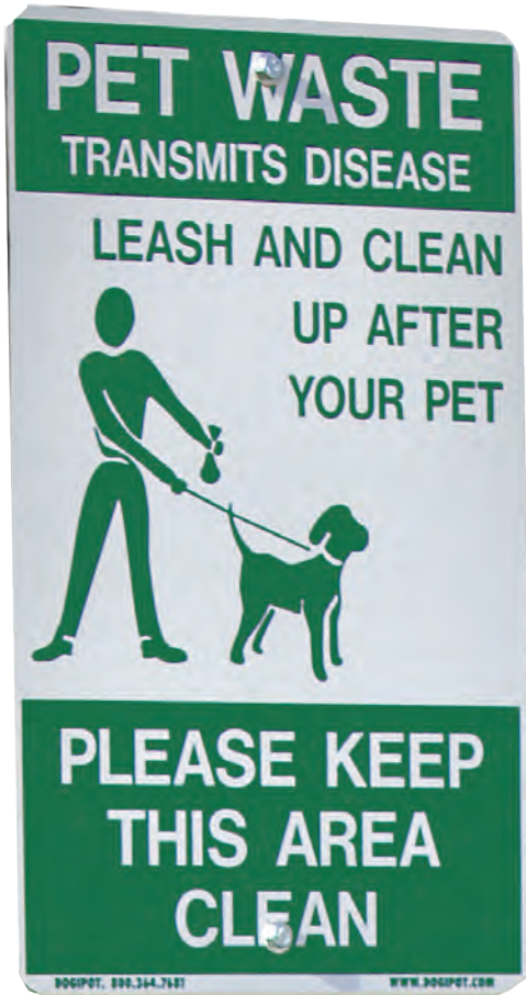
ON-LEASH Pet Sign Green #1203